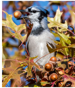
Blue Jay

that in general, plant communities are attempting to shift to higher latitudes or elevations to adapt to a warming climate, as well as shifting ranges in response to changing precipitation. "If there are no animals available to eat their fruits or carry away their nuts, animal-dispersed plants aren't moving very far," he says.