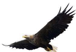
White-tailed Eagle

The Black Sea Biosphere Reserve, on the southern coast of Ukraine, is a haven for more than 120,000 migrating birds that spend the winter flitting about its shores. A multicolored spectrum of rare species - the White-tailed Eagle, Red-breasted Merganser and Black-winged Stilt, to name just a few - nest among its protected waters and wetlands. The reserve is also home to the endangered sandy blind mole rat, the Black Sea bottlenose dolphin, rare flowers - and, in recent weeks, an invading military.