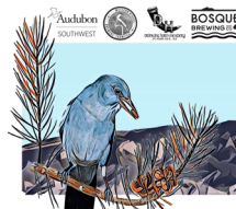
The new brew's label

To help build a community of folks willing to take action on its behalf, Audubon Southwest, Sangre de Cristo Audubon and Bosque Brewing Company are teaming up to launch a collaborative beer: "Oh Hey, Pinyon Jay!" Flavored with pinyon tips, prickly pear and local honey, cans of this brew will sport an image of the jay and a link to sign up for the growing Pinyon Jay community science program. With the help of the community, we can get a snapshot of the bird's status over a large geographic range and gather data we need to inform conservation efforts.