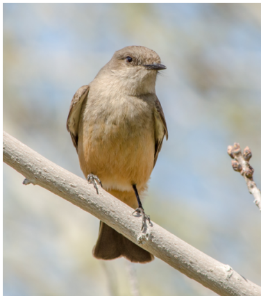
Say's Phoebe

The Sangre de Cristo Audubon chapter represents a landscape that has been occupied for millennia by peoples of diverse cultural backgrounds. We honor that diversity and believe that just as we strive to protect biodiversity, we must include and respect the diversity of the many people and cultures that call northern New Mexico their home.