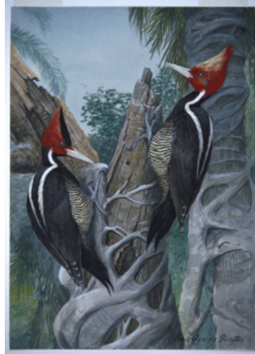
Ivory-billed Woodpecker/Painting by Louis Agassiz Fuytes

on their heads. Their numbers started to drop sharply in the 19th century due to human interference with their habitat and overhunting. With only a few of the birds left in largely inaccessible forests, confirmed sightings, let alone clear pictures, became almost impossible.