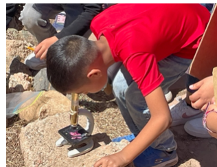
A student peers at pollen through a microscope during a field trip at Randall Davey Audubon Center

Many of the students come from Title 1 schools on the south side of Santa Fe (including Ramirez Thomas),